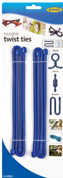
Twist Ties 45cm cords / 4pcs