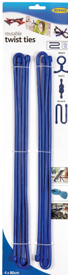
Twist Ties 80cm cords / 4pcs