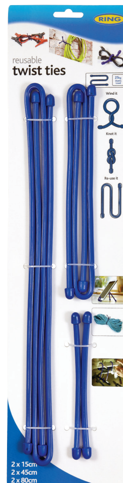
Twist Ties Multi cords / 6pcs